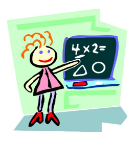
Academics (math, science, prereading, writing, and social studies)