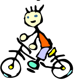
Large and small muscle development