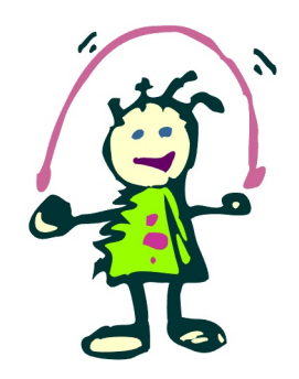
Social and emotional development

Each child will progress at his/her individual pace in these areas of development: